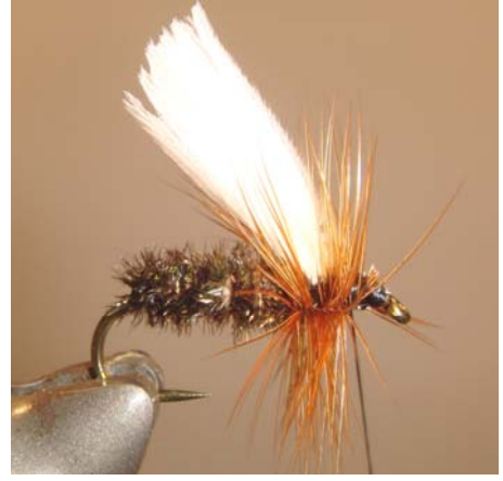
9. Wind the head hackle 2-3 turns behind the wing pair and 2-3 turns in front of the wings