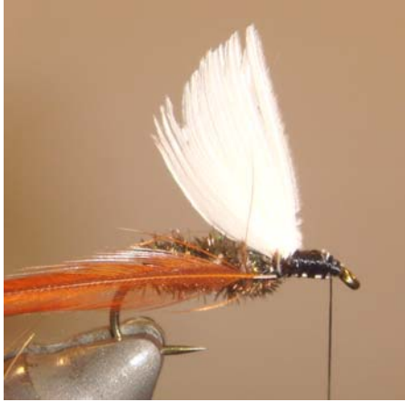
8. Tie in a brown cock feather