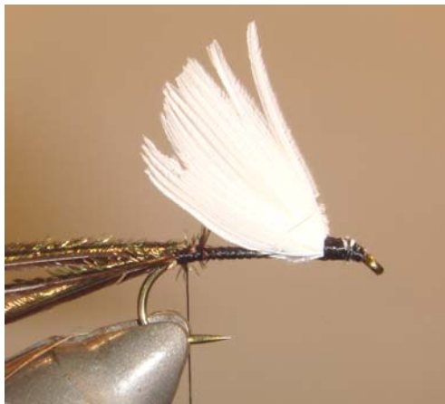
4. Tie in 2-4 Peacock herls