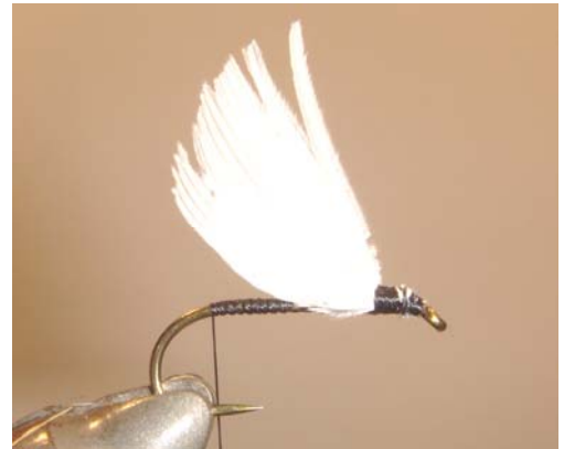
2. Tie in a pair of wings