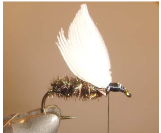
5. Wind the thread back to the wings