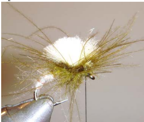
14. Insert the fibers of the olive CDC into the split thread 15. Twist the thread 16. Tie a parachute around the white post