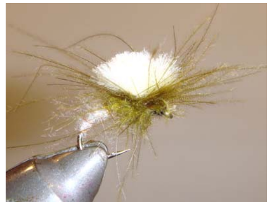
17. Tie a neat head 18. Whipfinish 19. Cut off thread