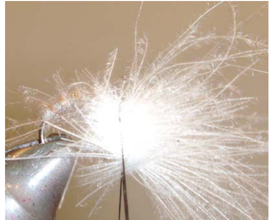
9. Get the fibers of a white CDC feather and insert them in a loop 10. With your fingernail push the fibers against the hook shank 11. Now start twisting the loop