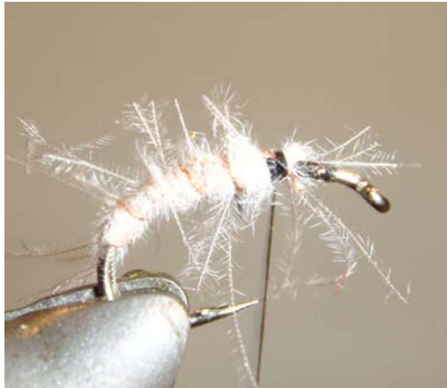
8. Rib the rear body with the copper wire