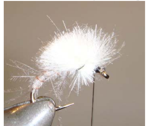
13. Cut the indicator into the correct shape