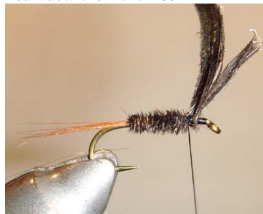
5. Wind body with the raven barbs 6. tie off