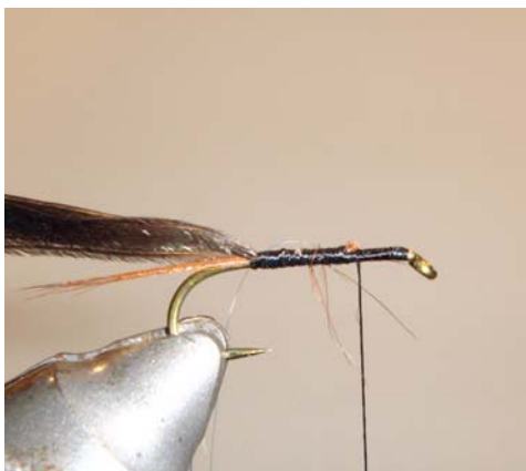
3. Tie in the tips of a few raven barbs 4. Wind the thread to the eye of the hook