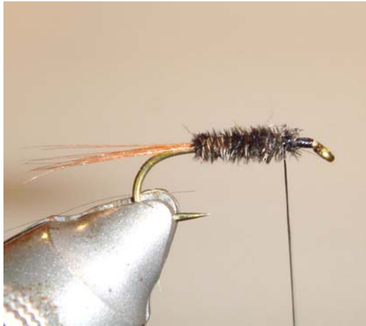
7. Cut off excess