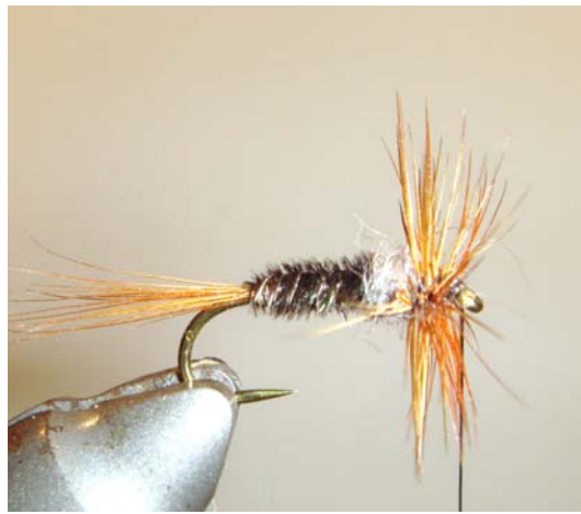
9. Tie in brown cock feather