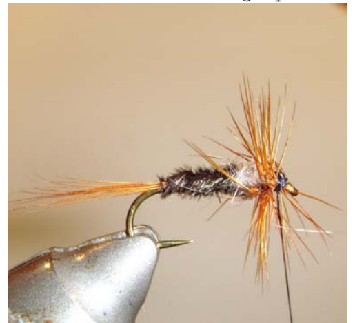
11. Wind head