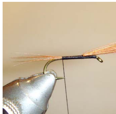
2. Tie in a few barbs of the brown cock feather as a tail and fix them by winding the thread up to the curvature of the hook