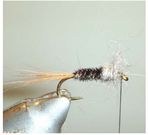
8. Tie the thorax with grey dubbing