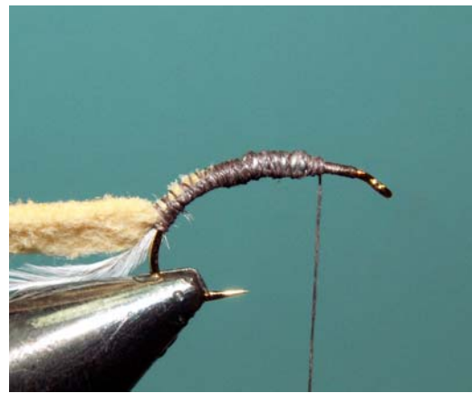
4. Tie in the leather strip at the lead wire and fix it down into the curvature of the hook