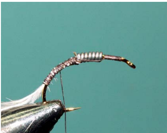
3. Tie in the long Ostrich herls on each side of the hook shank