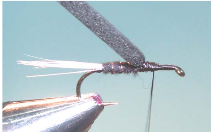
6. Tie in the polycelcon strip