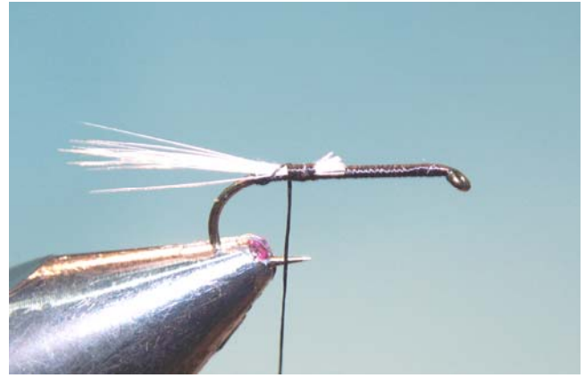
2. Tie in the tail feather tips