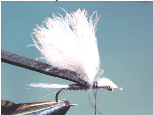
7. Tie in two CDC Puffs