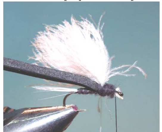
8. Dub the thread with black mole skin dubbing