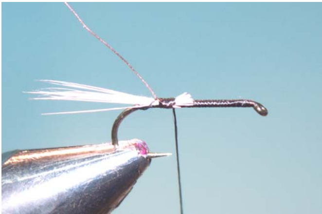
3. Tie in the ribbing wire