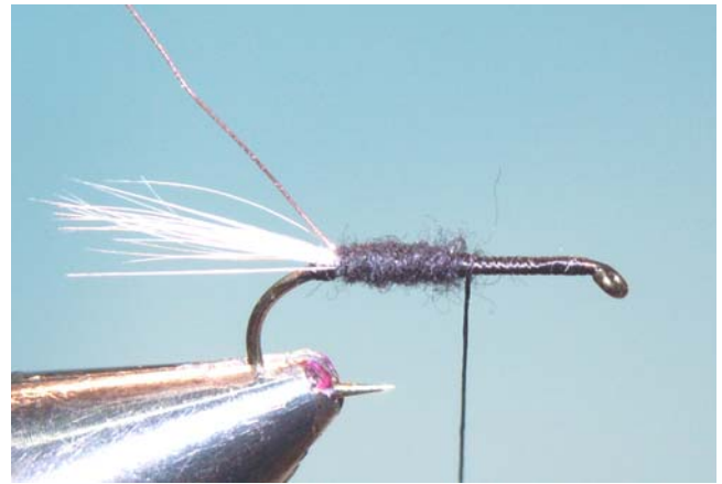
4. Dub the thread and wind the body of the fly