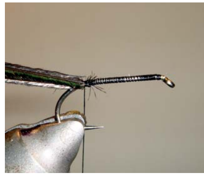
2. Tie in two Peacock herls