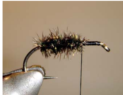
6. Wind the body with the twisted peacock herl