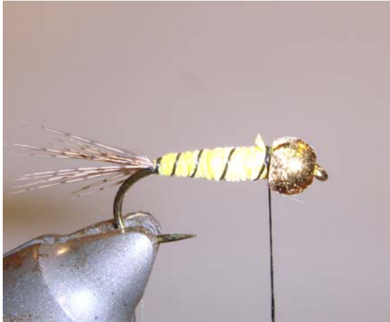
8. Rib the body with the tying Thread