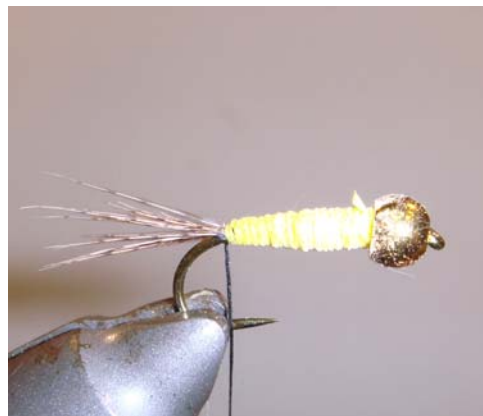
5. Tie in the yellow floss 6. Wind a conical body 7. Whipfinnish and cut excess