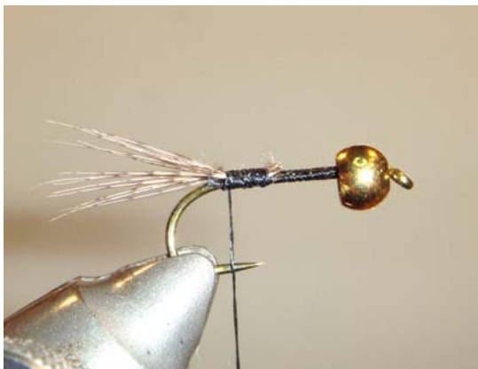
3. Tie in some partridge feather tips as a tail 4. Leave the tying thread at the curvature of the hook