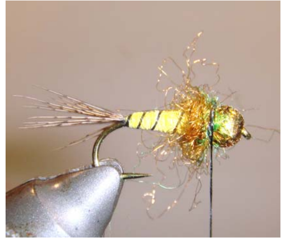
9. Twist the dubbing on the tying thread