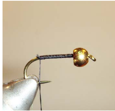
2. Tie-in the thread and wrap it to the curvature of the hook