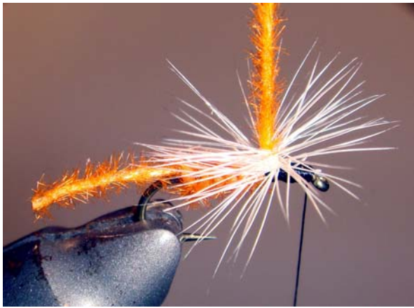
10. Wind the head