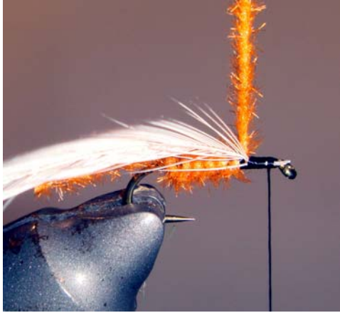
7. Tie in the cock feather