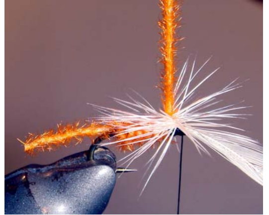
8. Wind a parachute with the cock feather