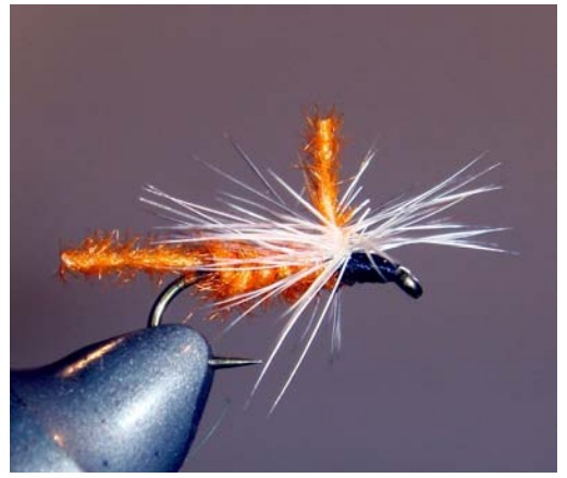
12. Trim the tail and the stem of the parachute