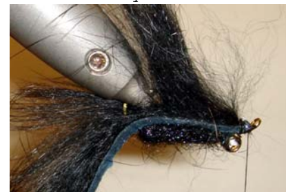
11. Rotate the head of the vise for 180° 12. Secure the zonker strip at the eye of the hook