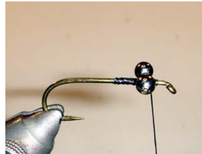
2. Tie-in the bead chain eye pair 3. Eventually secure the tied in eyes with a drop of instant glue