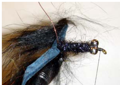
8. Remove the hook from the vise 9. Impale the center of the zonkerstrip on the leather side on the hook 10. fix the hook in the vise