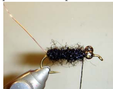
6. Twist the ice dub in a dubbing loop 7. Wind the body