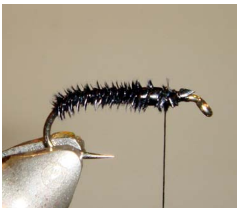
3. Wind the quill to the eye of the hook to form the body