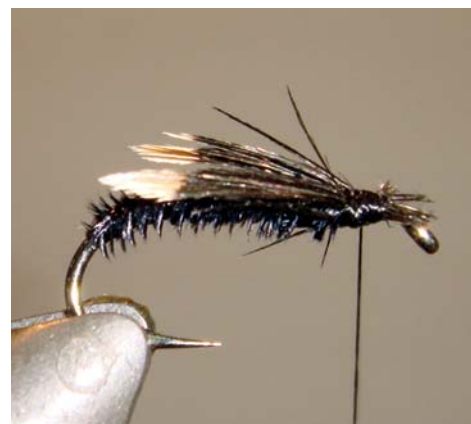
4. Tie in two sparrow feather tips as wings