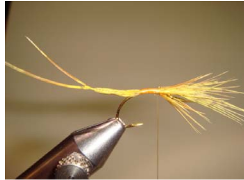
8 Cut out the quill of the partridge feather