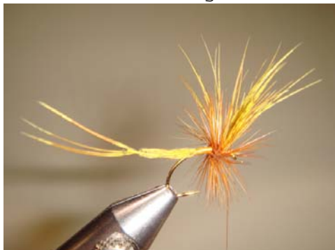
13 Wind the hackle in direction of the eye. (3-4 turns behind the wing and 2-3 turns in front of the wing)