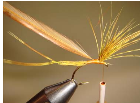
11 Tie in the cock feather