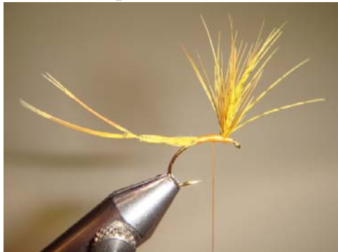
9 Lift the partridge feather tips and wind a few turns in front of this wing