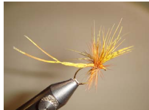
14 Wind the head