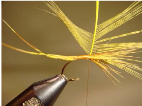
7 Lift the stem of the partridge feather upwards