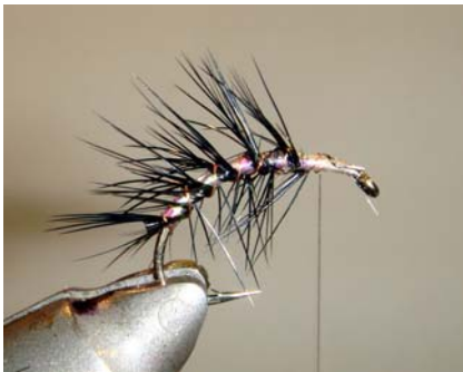
11. Wind the silverwire as a ribbing through the cock feather to the eye of the hook