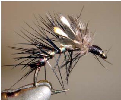
Optionally you may wind a head hackle with twisted black seals fur or a black hen feather