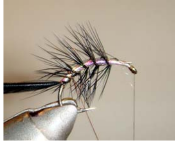
9. Wind a palmered body with the cock feather