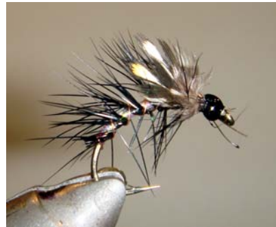
15. Secure the head with a drop of black head cement