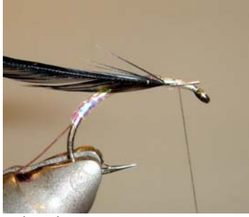
8. Tie-in the cock feather