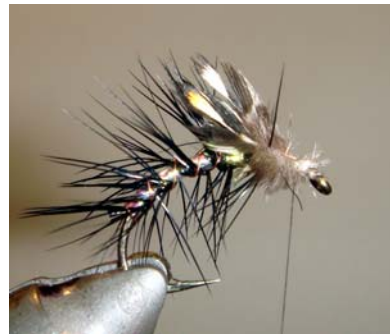
12. Tie-in a small jungle cock feather on each side of the hook shank