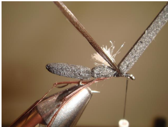
10 Tie in the black cock feather