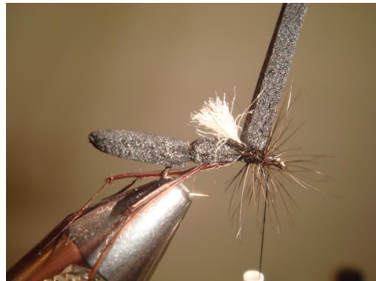
11 Wind the cock feather to the eye of the hook