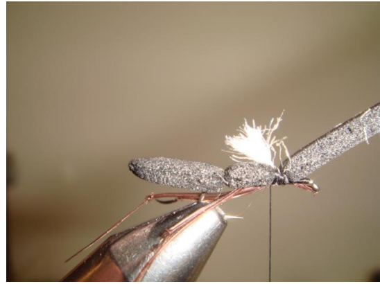
9 Tie in a strand of glow yarn