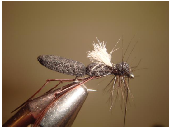
13 Flip the foam strip to the eye of the hook