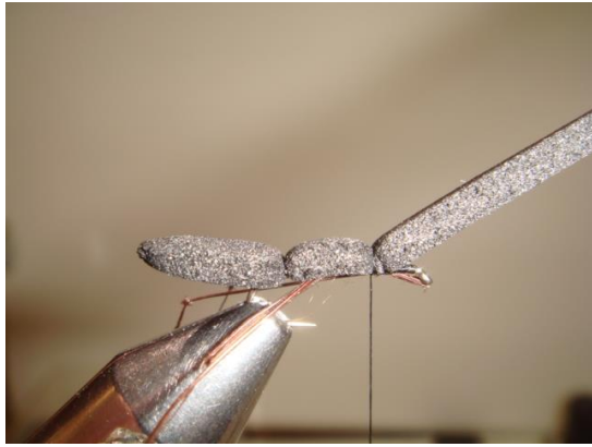
7 Flip the foam strip to the tie in point of the legs