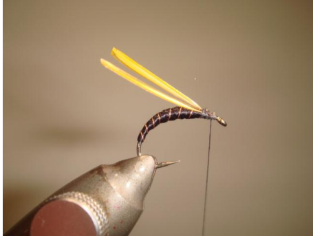
9 Tie in an orange goose biot on each side of the hook shank