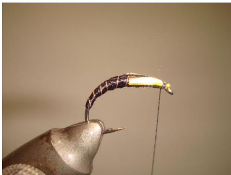
12 Flip over the biots to the eye of the hook