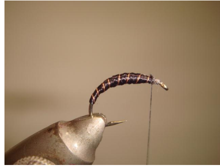
8 Wind the ribbing