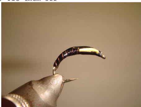
16 Cover the whole body with UV glue