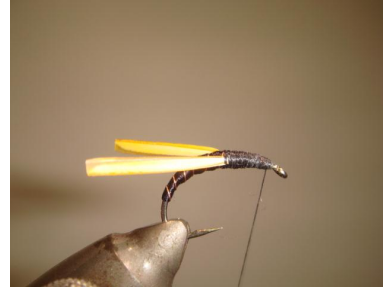
10 Secure the biots