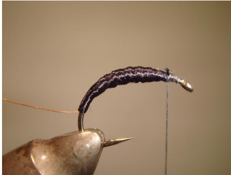
7 Tie off the Unistretch