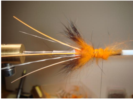
9 Tie in the orange rabbit zonker strip hair tips as a 1 st hackle