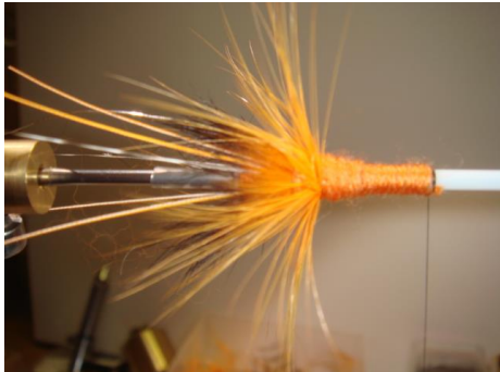
13 Tie in the orange wool and wind the front part of the body