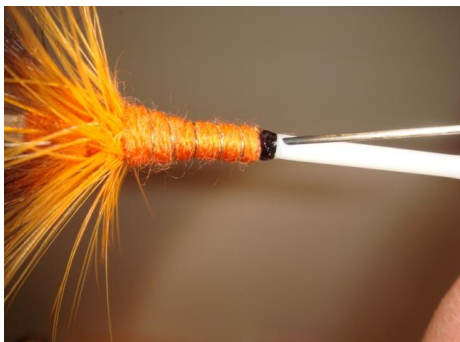
16 Using a needle make a hole in the tube in front of the head (for hitching)