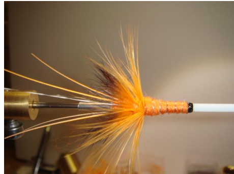
14 Rib the front body with the silver wire