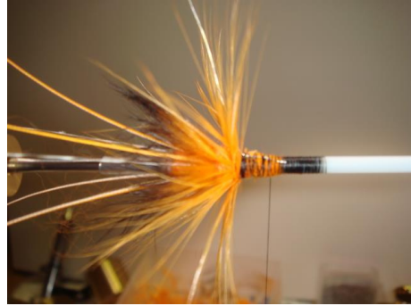
12 Tie in the silver wire in front of the hackle