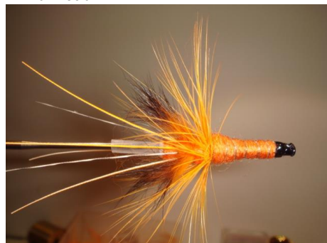
17 Trim the tube