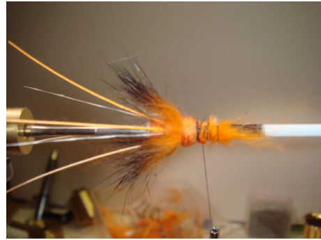
10 Tie in the orange wool and cover the tie in point of the hair tips