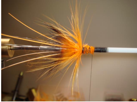
11 Tie in the orange cock feather and wind the 2 nd hackle