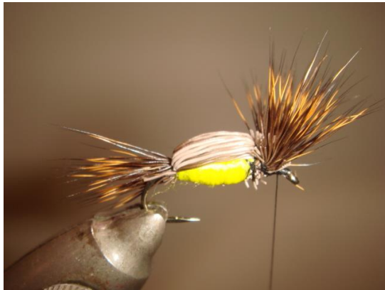
10 Flip the deer hair tips over the body to the tie in point of the wings 11 Tie off and cut off the excess