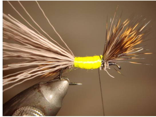
8 Tie in the yellow unistretch 9 Wind a tapered body with the Unistretch