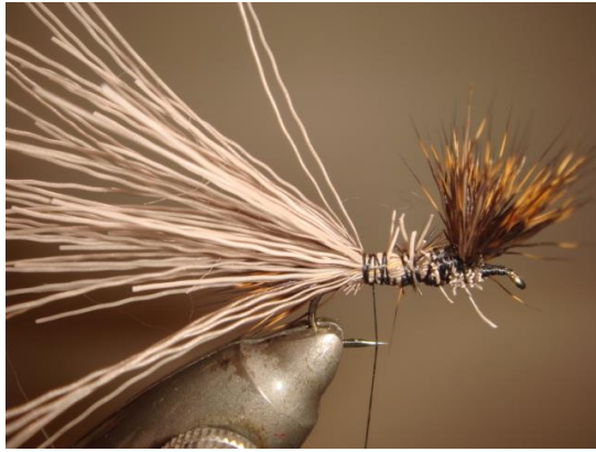
7 Tie in a bunch of deer hair tips with the tips