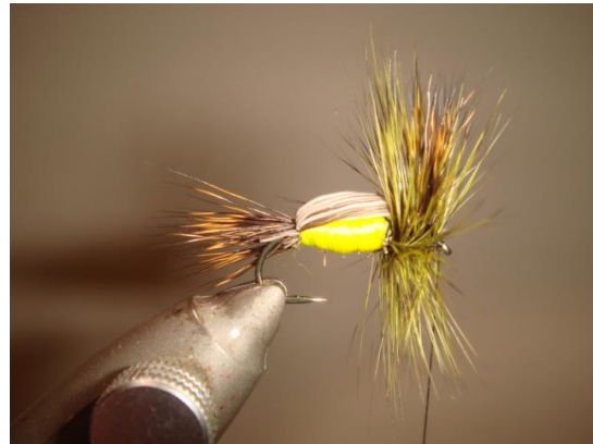
12 Tie in the cock hackle 13 Wind the hackle (three turns behind the wings and at least two in front of the wings)