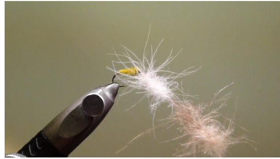
13 Split the thread and insert a bunch of white CDC feather tips and a bunch of dark grey CDC feather tips in the split thread 14 Twist your bobbin to secure the feather tips in the thread