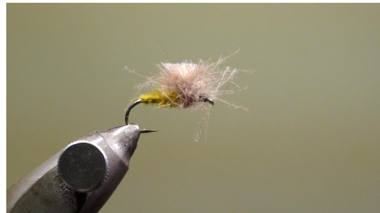
19 Trim parachute post and parachute feather tips to the correct length