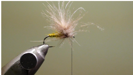
15 Wind the post of the fly pulling the white feather tips upwards after each turn