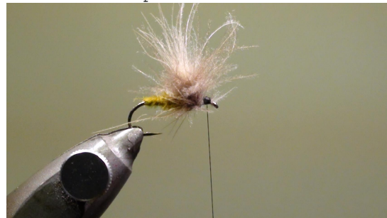
17 Wind the head of the fly