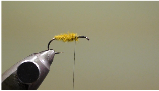
11 Cut off the excess of the feather 12 Trim off all free fiber tips