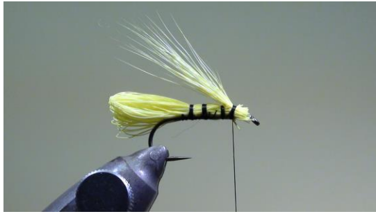
9 Tie in a small bunch of bucktail as a first wing