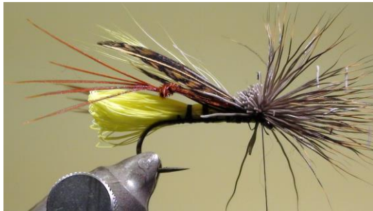
12 Tie in a bunch of deer hair directly behind the eye of the hook, the tips extending over the eye