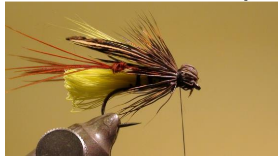
13 Flip back the deer hair tips 14 Tie off the deer hair tips in a way to create a thick head