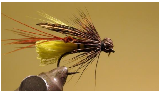
15 Whipfinish 16 Cut off the thread