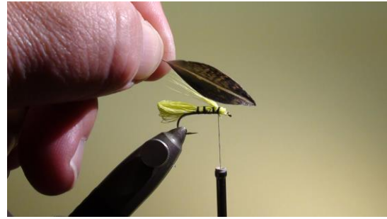
10 Prepare the partridge feather 11 Tie in the feather as a second wing which will be slightly shorter than the bucktail wing