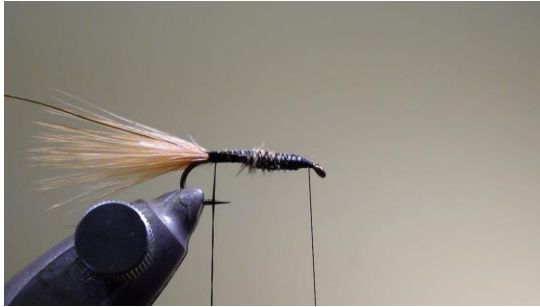
9 Create a dubbing loop 10 Wind the thread to the eye of the hook