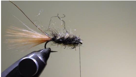
12 Twist the blended dubbing in the dubbing loop 13 Wind the body