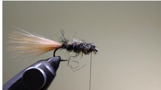
14 Wind the ribbing wire to the eye of the hook 15 Tie off and cut off the ribbing wire