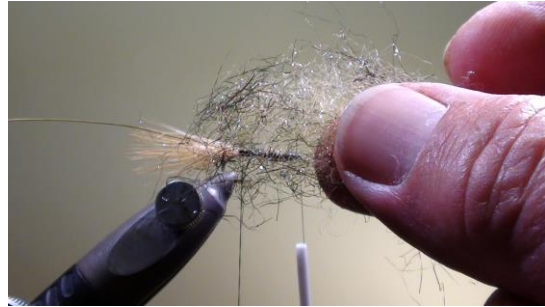
11 Blend some black and pale yellow ice dubbing together