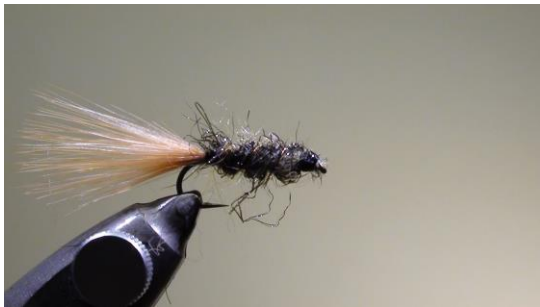
16 Wind the head of the fly 17 Whipfinish