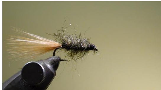
18 Brush out the dubbing