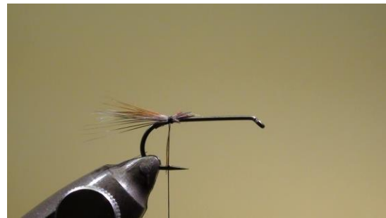
2 Mix a bunch of grizzly and brown cock feather tips