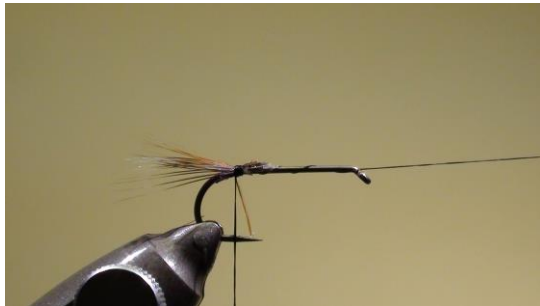
4 Make a dubbing loop at the curvature of the hook