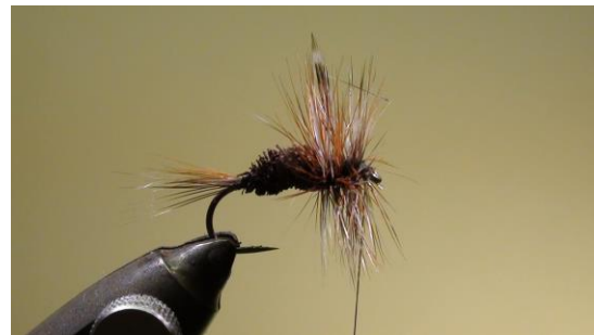
20 Wind the grizzly cock feather to the eye of the hook (3 turns behind an 3 turns in front of the wings)