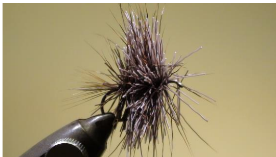
8 Repeat steps 6 and 7