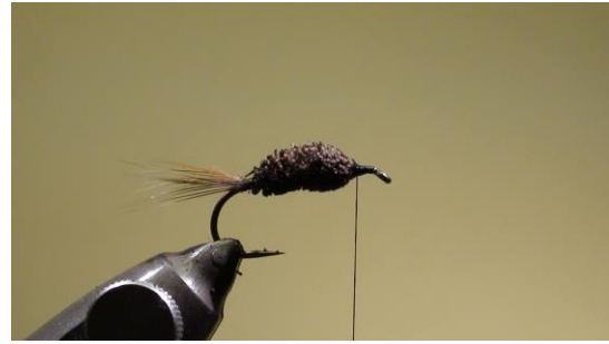
12 Singe the body using a lighter