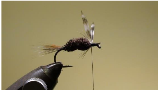
14 Tie in 2 grizzly cock feather tips as wings