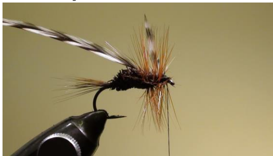
17 Wind the brown cock feather to the eye of the hook (3 turns behind an 3 turns in front of the wings)