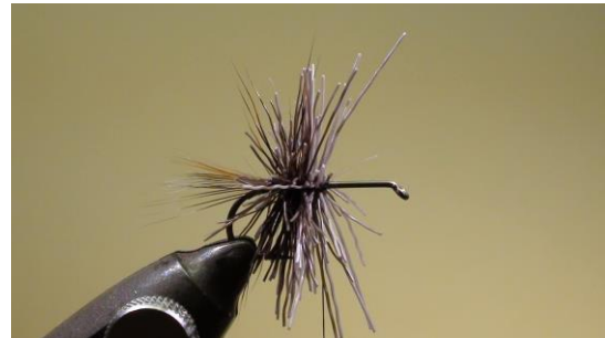
6 Twist a bunch of deerhair in the loop