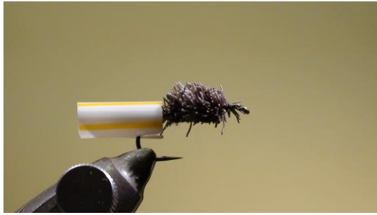
11 Slide the Drinking straw over the body as a protection for the tail