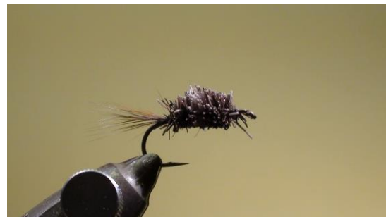
10 Shape the body roughly with your scissors