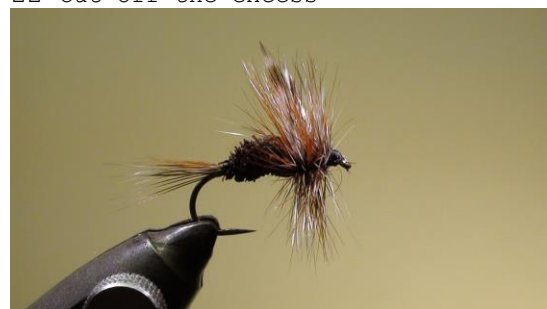
25 Apply a drop of transparent head cement to secure the windings