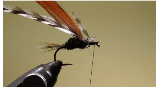
15 Tie in a grizzly cock feather