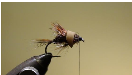
23 Wind the head of the fly