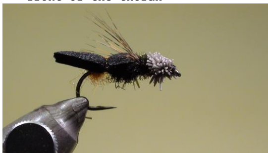
18 Whipfinish behind the eye of the hook