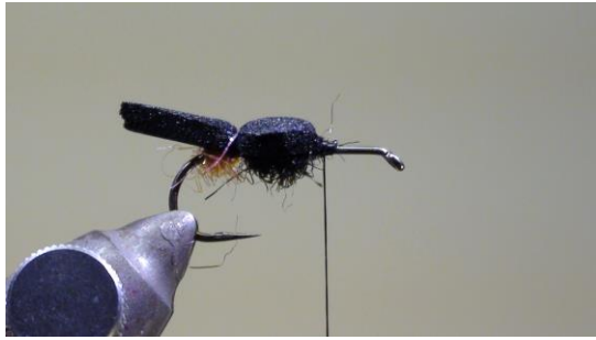
9 Flip the foam strip over the body 10 Tie it off