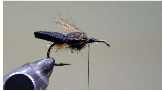
11 On each side of the hook shank, tie in a bunch of Pardo feather tips as wings