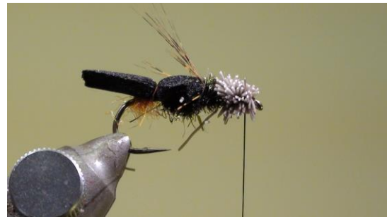
17 Shape the deer hair tips to a head