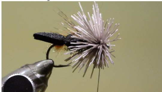
16 Tie in a bunch of deer hair in front of the thorax