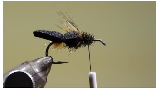
15 Wind the thorax with the reinforced peacock herl