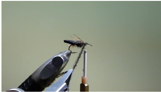
12 Tie in a peacock herl on the hook shank