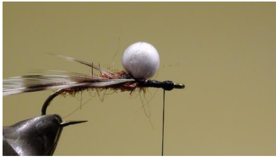
11 Wind the thread to the eye of the hook