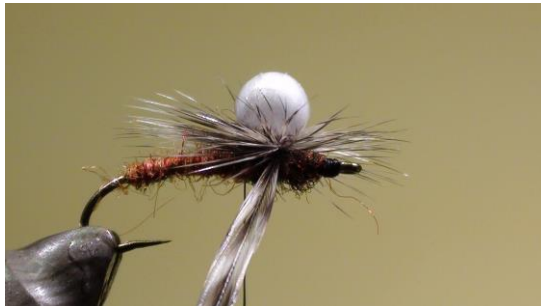
15 Wind the Parachute with the grizzly feather (each successive turn under the previous turn)