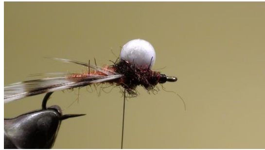
13 Twist some dark grey dubbing onto the tying thread.