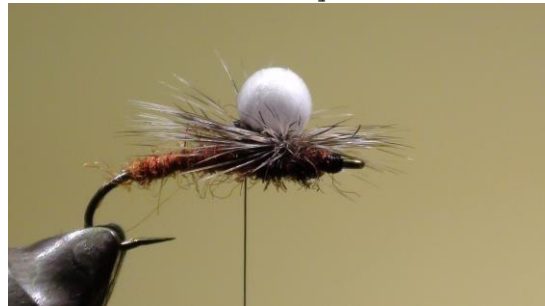
16 Tie off the feather below the parachute around the styrofoam ball just above the hook shank