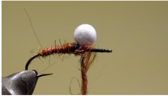
9 Wind the rear part of the body with the dubbed thread