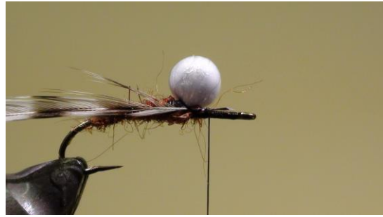
10 Tie in the grizzly cock feather