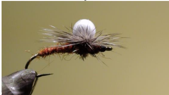
17 Whipfinish around the Styrofoam ball just above the hook shank