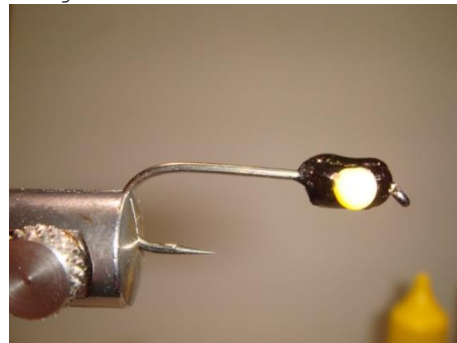
4 Add a drop of yellow window color on both sides of the head to represent the eyes of the fly