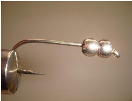
1 Thread two 4mm copper beads on the hook shank