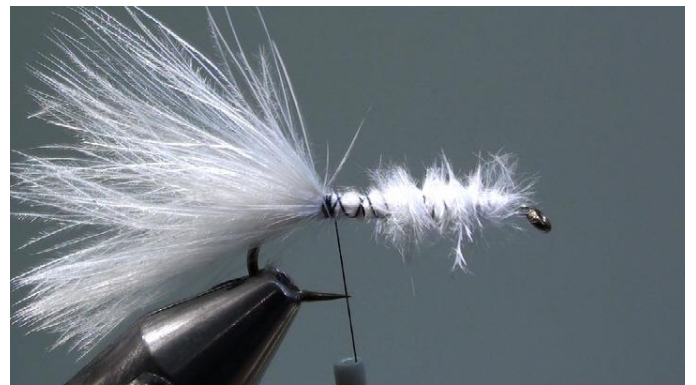
2. Tie-in the a bunch of marabou feather tips as a tail