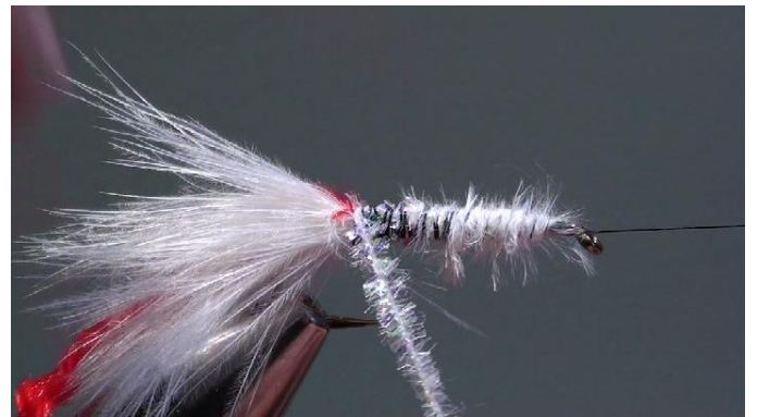
4. Tie in the white chenille 5. Wind the thread to the eye of the hook