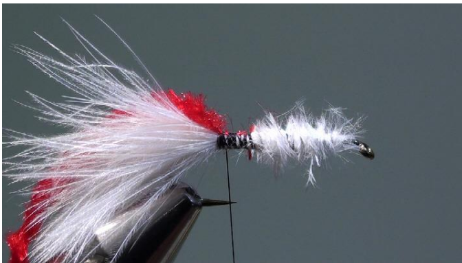
3. Tie in the red chenille