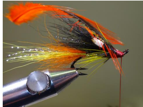
24. Tie in the orange badger cock feather