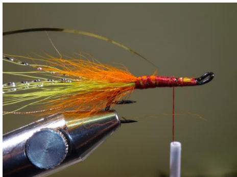
11. Tie in the gold tinsel