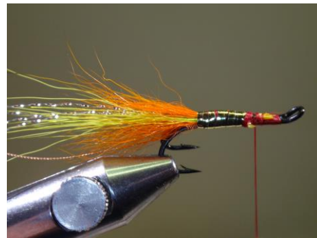
12. Wind the rear part of the body with the gold tinsel