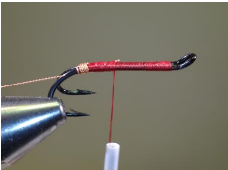
3. Wind the tag of the fly