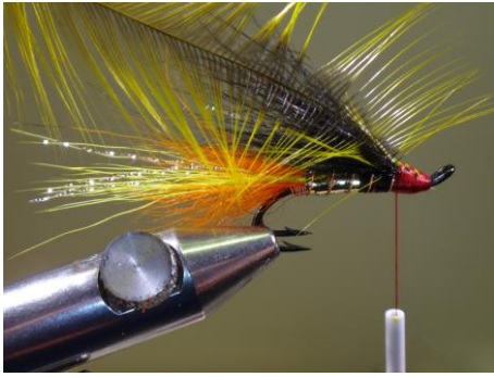
21. Tie in the yellow badger cock feather