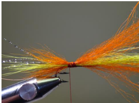
7. Tie in a bunch of fox hair (length of hook shank)