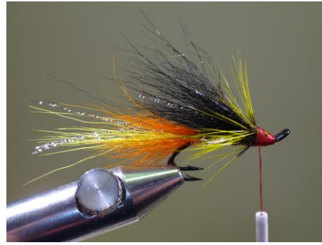
22. Wind the first hackle (2 turns)