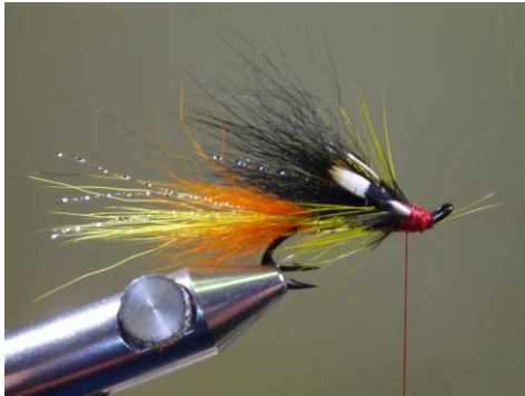
23. Tie in the jungle cock cheeks