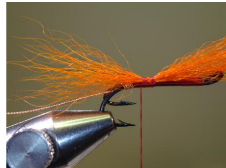
4. Tie in a bunch of fox hair (length of hook shank)