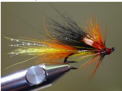
28. Apply a drop of UV glue to the head