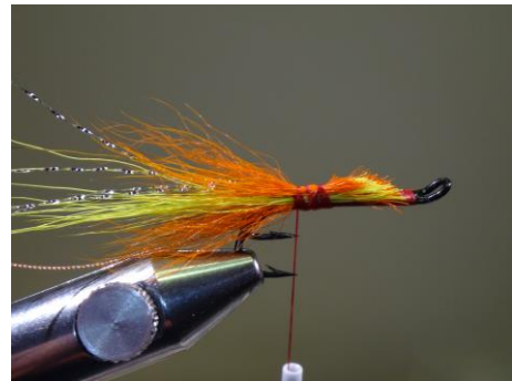
8. Cut off the excess