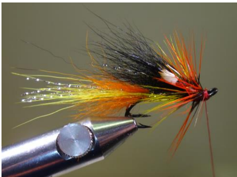
25. Wind the second hackle (2 turns)