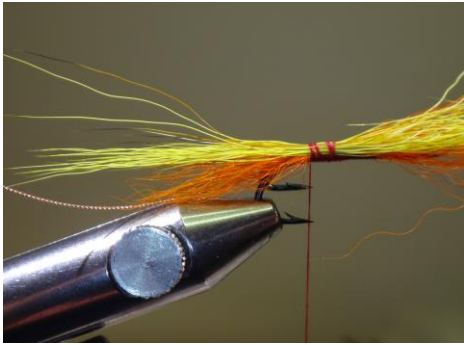
5. Tie in a bunch of yellow bucktail hair (double hook shank length)