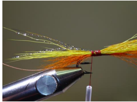
6. Tie in 4 strands of Chrystalflash