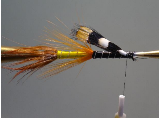
26 Tie in 2 jungle cock feathers as a wing (roofed)