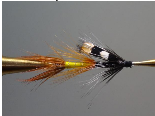
30 Wind the head of the fly