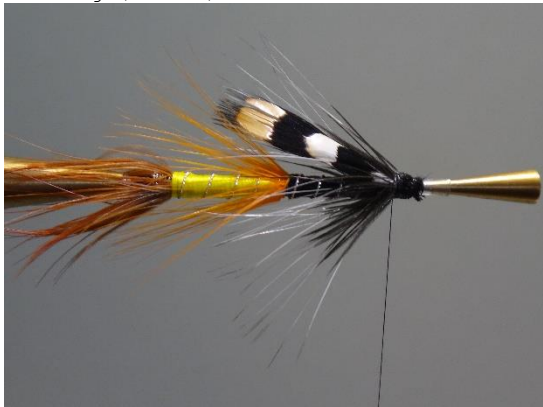
28 Wind 2 turns of wet hackle