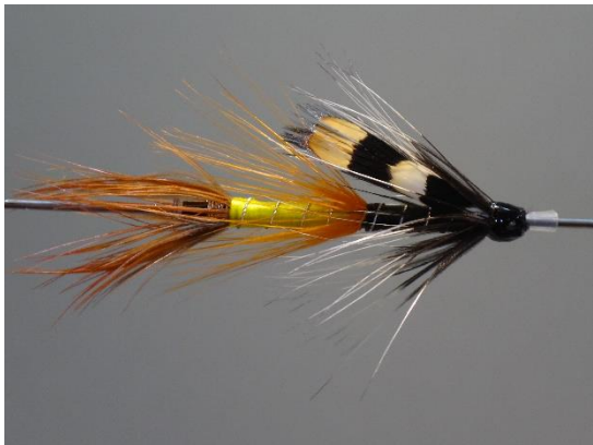
33 Apply a drop of UV glue or black head cement on the head to secure your windings