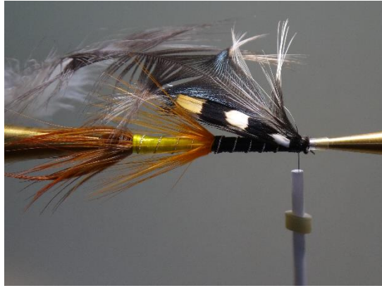
27 Tie in the silver badger cock feather with its tip