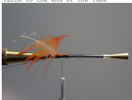
3 Wind the twisted wire forwards for 5 - 6 turns