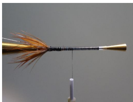
7 Wind 2 turns with the GP feather