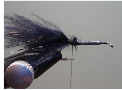
8. Trim the tail by tearing off the tips of the Marabou