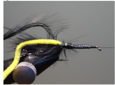
10. Tie in the yellow Chenille