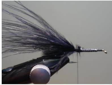
7. Tie in a bunch of black Marabou feather tips