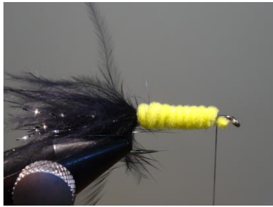
11. Wind the Chenille in direction of the eye of the hook