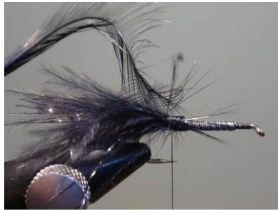
9. Tie in a black cock feather by its tip