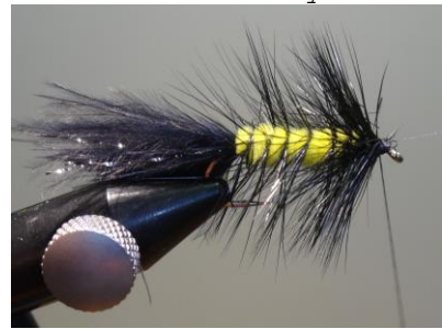
14. Wind a wet head hackle