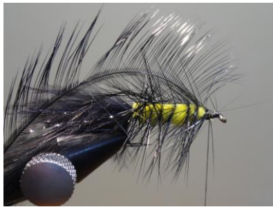
13. Tie in a bigger cock feather by its tip