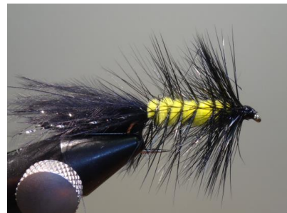
16. Apply a drop of UV glue to the head