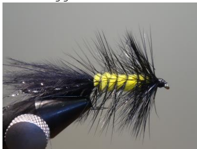
15. Wind the head of the fly