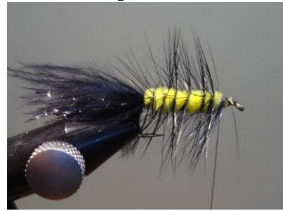
12. Wind the cock feather in direction of the eye of the hook