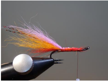
8. Tie in the magenta fox tail (double length of the shank)