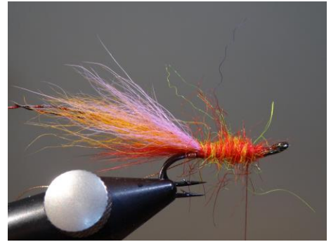
9. Blend the red and yellow seals fur together