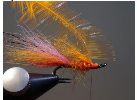
15. Tie in the orange cock feather by its tip