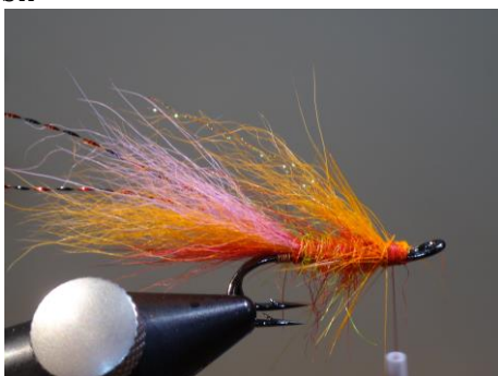
16. Wind 2 turns of wet hackle