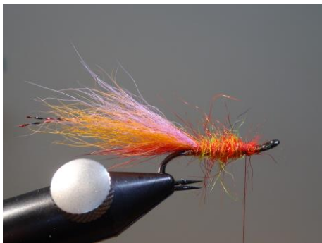
12. Wind the ribbing wire to the eye of the hook