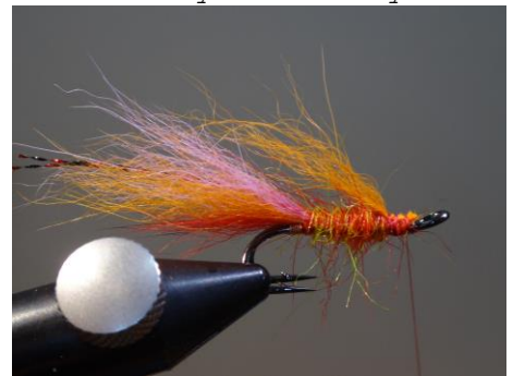
13. Tie in the orange fox hair as a wing