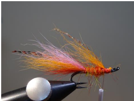
14. Tie in 2 strands of orange Chrystal flash