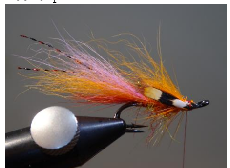
17. Tie in 2 jungle cock feathers as cheeks