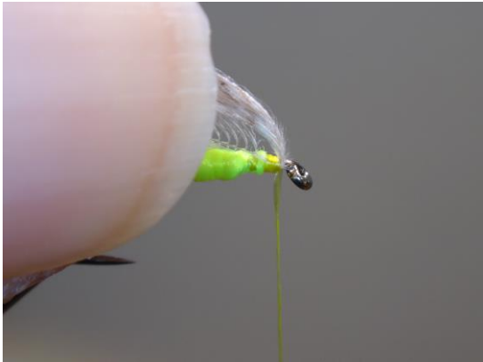
8 Fold back the tip and secure it with the tying thread