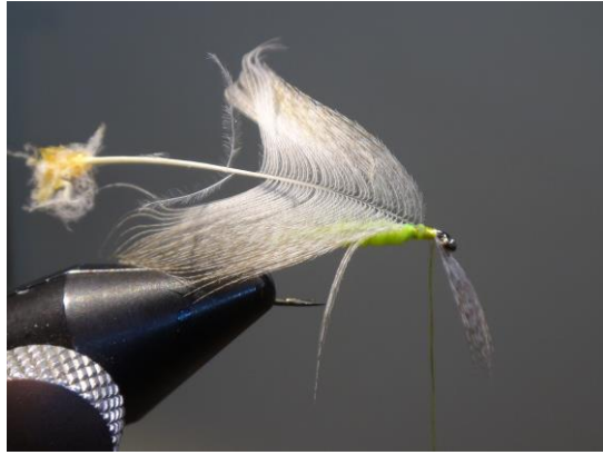
7 Tie in the feather with its tip