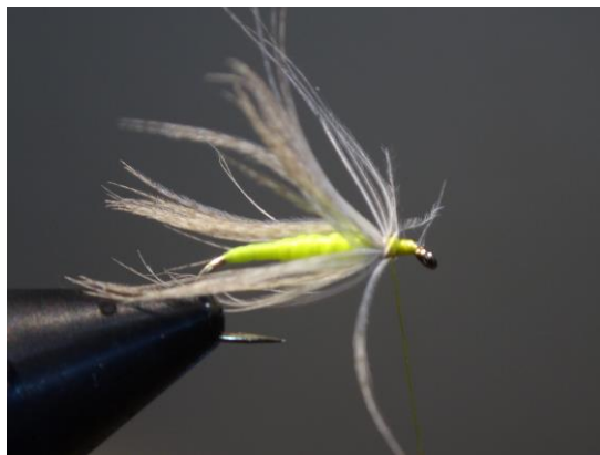
11 Wind the wet hackle 12 Wind the head of the fly 13 Whipfinish