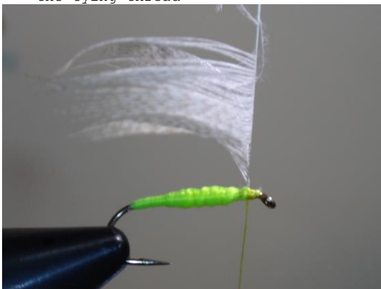
10 Fold back the feather tips