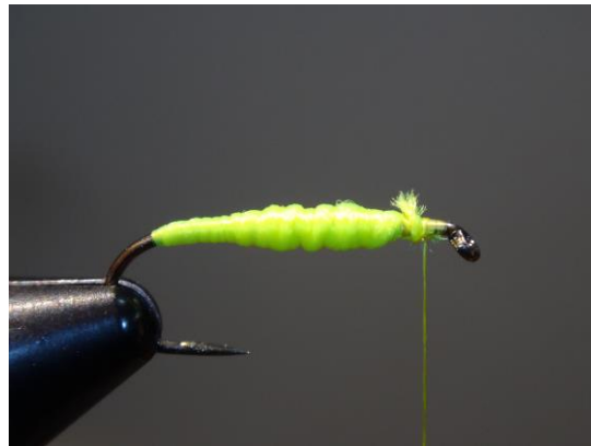
4 Wind a tapered body with the Unistretch 5 Tie off the Unistretch