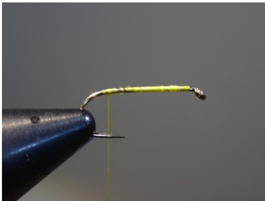
1 Tie in the thread at the eye of the hook and wind it in close turns to the beginning of curvature of the hook