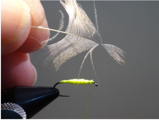
6 Prepare the white duck breast feather as shown above