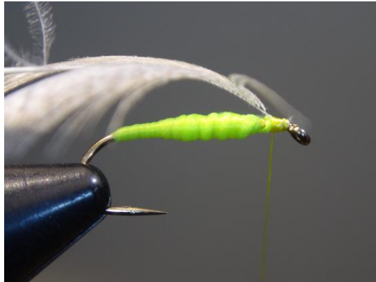
9 Cut off the tip of the feather