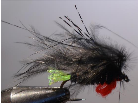
15 Tie in 4 strands of black Crystalflash on top the wing