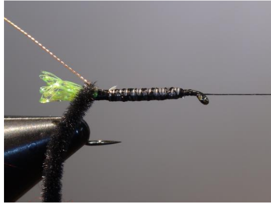
7 Tie in the core of the chenille