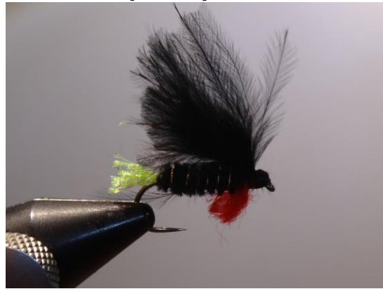
18 Wind the head of the fly 19 Whipfinish