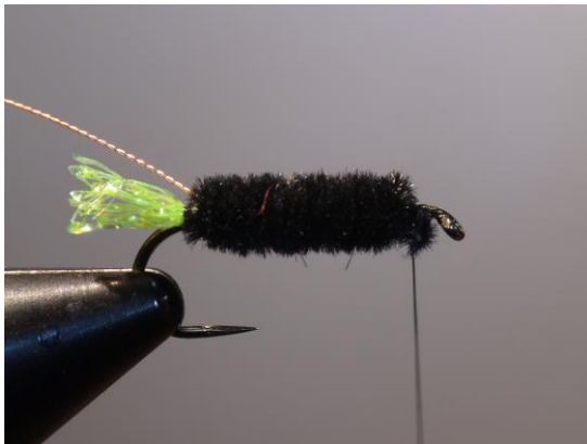
9 Wind the body of the fly