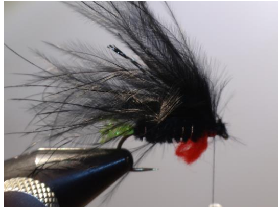
16 Tie in a second bunch of Marabou feather tips on top of the first one