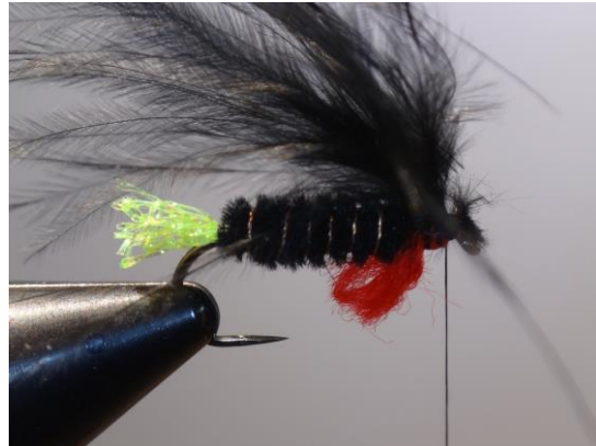
14 Tie in a first bunch of Marabou feather tips as a wing