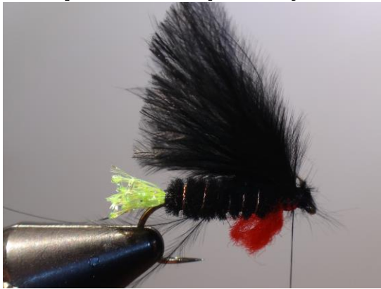
17 Trim the wing using your scissors