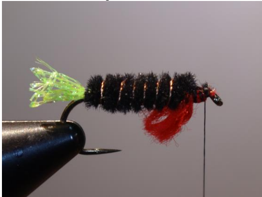
13 Tie in the red wool strand as a throat