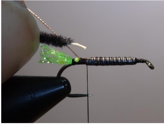
6 Remove the fluff from the tip of the core of the chenille